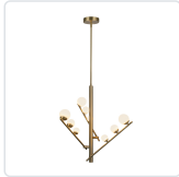
CH55524-BG/OP Brushed Gold/Opal Matte Glass