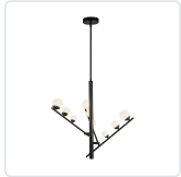
CH55524-BK/OP Black/Opal Matte Glass